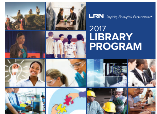
LRN 2017 Course Library

In 2016, we added the following new courses that reflect these principles: “Labor and Employment: An Overview (Global);” “Labor and Employment: Creating an Ethical Culture (Managers);” “Global Data Protection and Privacy: Respecting a Person’s Privacy;” and, “Preventing Harassment in the Workplace.” Our courses “Respect in the Workplace” and “Global Trade Sanctions” were updated to become accessible on all commonly used mobile devices.